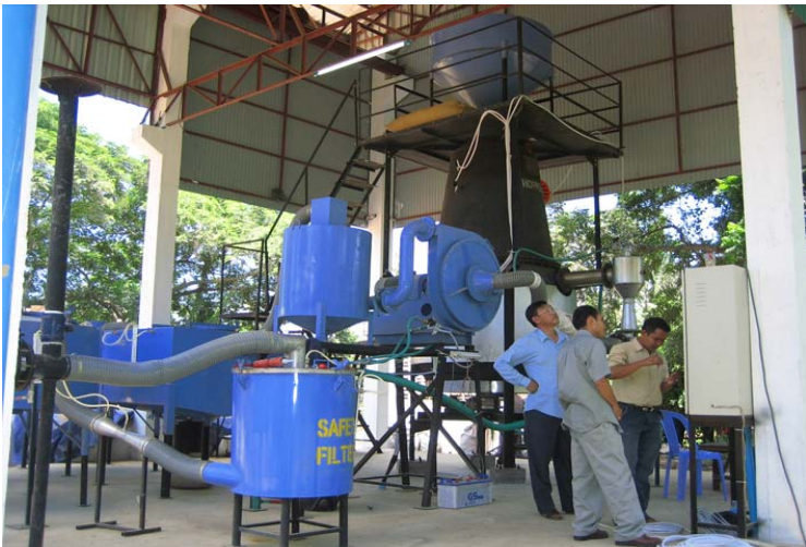
Rice Husk Gasifier: 200 kW, installed at rice mill in Battambang